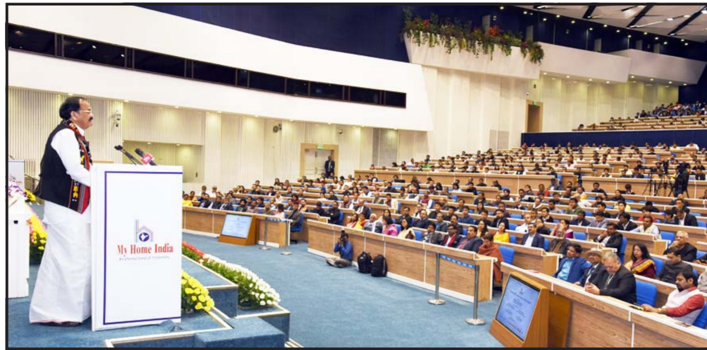
The Vice President, Shri M. Venkaiah Naidu addressing the gathering at the 13th Anniversary Celebrations of My Home India organization, in New Delhi on February 26, 2019