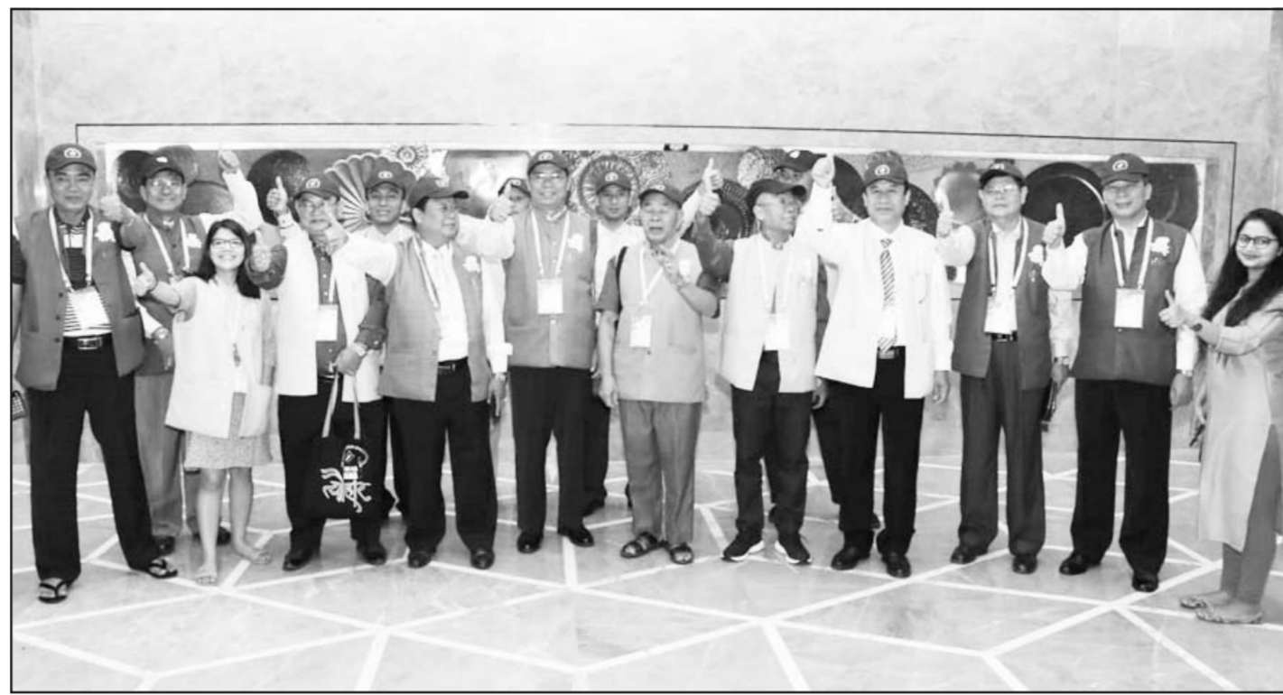
The representatives of 20 Election Management Bodies (EMBs) across the World witnessed the 17th Lok Sabha Election as part of the Election Commission's - Election Visitors' Programme, in New Delhi on May 12.

The company offers a complete suite of products ranging from Motor, Health, Personal Accident, Travel and Home Insurance in the retail space and products like Aviation, Fire, Marine, Package, Construction & Engineering and Liability Insurance in the commercial space. (16)